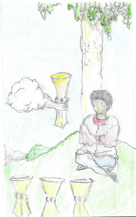
FOUR of CUPS