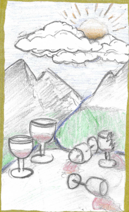
FIVE of CUPS